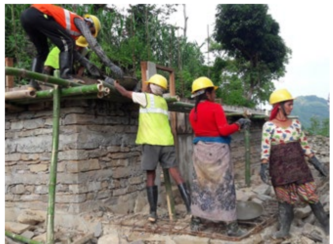
Female participants of 50 days vocational mason training with their male counterparts in Manbu-2 of Gorkha district organized by CRS. Females are highly encouraged and prioritized in the mason training events so that they can equally contribute in the housing reconstruction post 2015 Nepal earthquake. This 50 days unskilled mason training is tied up with demo-house construction.

Total population in the target area was approximately 90,000, with almost 25% meeting specific vulnerability criteria such as People with Disability (PWD) headed families, Dalit and Janajati (e.g. Maaji Communities from Central Region of Gorkha), Landless families or Families headed by elderly (>65years). For shelter activities, door-to-door technical assistance was given to all families reconstructing, regardless of status, but those families meeting some of the criteria above received additional support through livelihoods and Cash for Work programs.