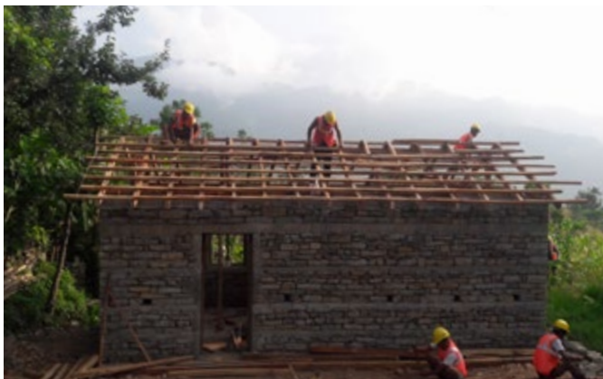
Participants of 50-days unskilled training busy in roof constructions of demo-houses at Aruarbang-4 in Gorkha district. CRS is making more than 90 demo-houses incorporating and highlighting all earthquake safe building elements so that the community can replicate to construct their homes making compliance to government norms and access the housing grant.