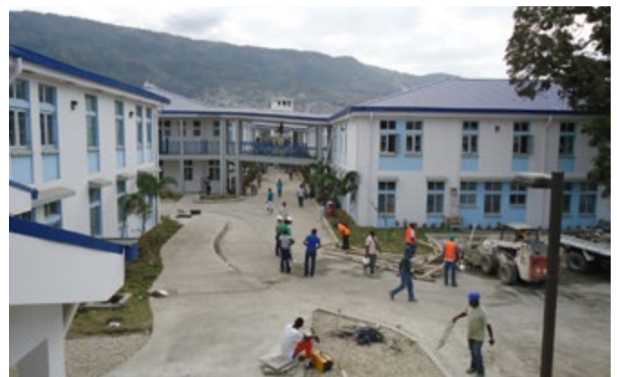
Workers make the finishing touches to the hospital grounds before handing over for opening.