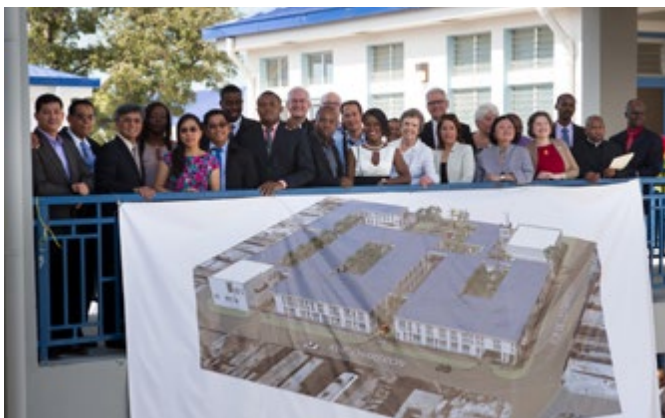
CRS delegates participate in the opening of the St. Francois de Sales hospital in Port-au-Prince, Haiti, January 15, 2015.

In collaboration with Partners for Health, CRS engaged in a selection process for the construction firm and medical equipment suppliers, which was ratified and approved by Sur Futuro partnership. IMEC contributed to the design of patient flow and installation of equipment.