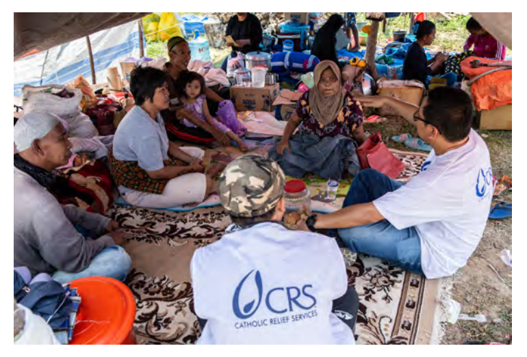
In Sulawesi, Indonesia, after a catastrophic earthquake and tsunami in September 2018, CRS staff meet with displaced families to talk about their priority needs and concerns.

• In plenary, ask each group to read the risks they have prioritized as high or medium, and place their sticky notes beside the flip chart. Group together those that are the same.