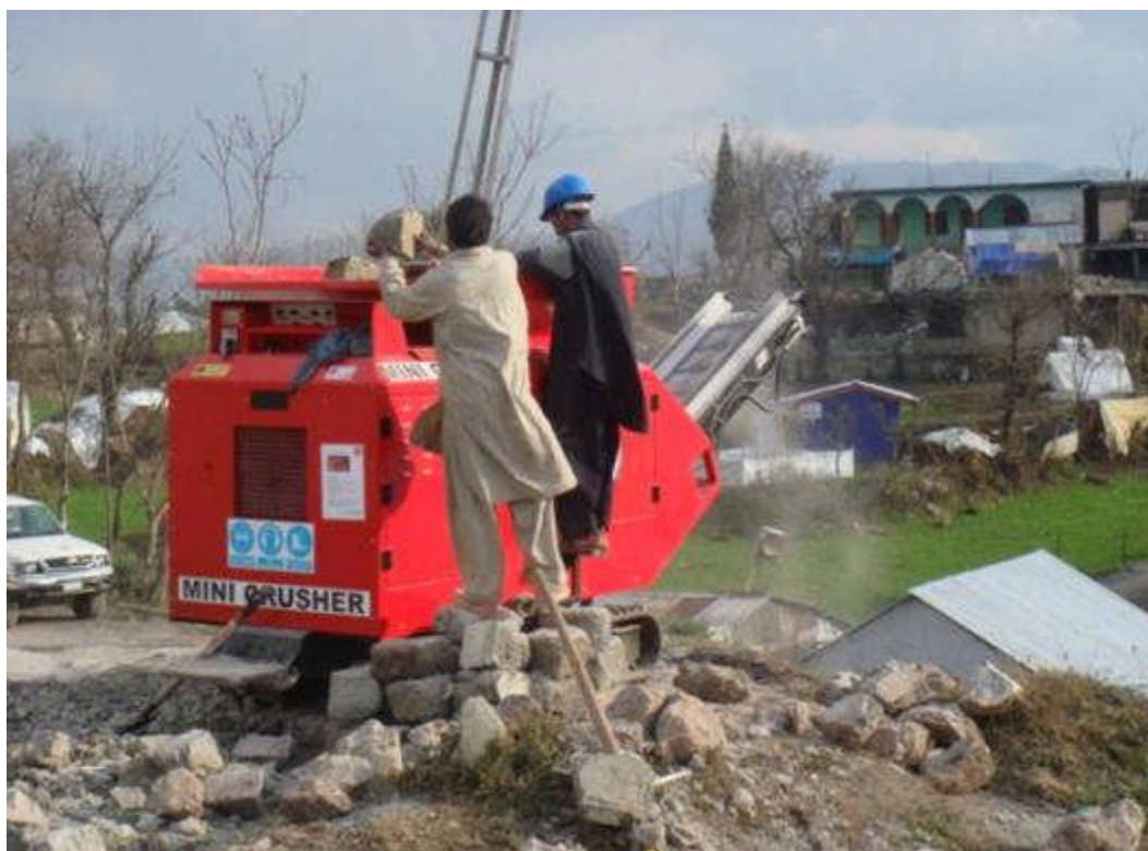
Photo 26: Crushing of debris in Pakistan following the 2005 Earthquake, using a small, mobile handfed crusher on tracks. (Source: Islamic Relief, Pakistan).

These smaller crushers can be transported by typical 4x4 vehicles and are operated by remote control, thus allowing access to even the most rural areas of a disaster affected community. The output crushed material is not suitable for engineered roads or low strength concrete but can be used for access road rehabilitation or as general fill, i.e. for parks.