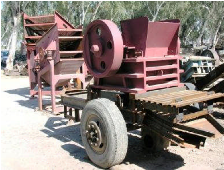
Photo 25: Locally manufactured “mobile” crusher from Pakistan quarries.

With there often being a quarry industry in many countries of the world, there is typically a service industry to these quarries. Thus it can often be possible to have locally manufactured small scale crushers produced “to specification” and used in the post-disaster clean-up and recycling works. Discussions with these manufacturers should include consideration for the handling reinforcement bars when crushing the concrete, which will often require a larger aperture for the outlet of the feed hopper.