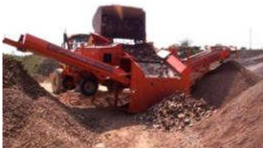
Photo 24: A primary screening feedstock for removal of soil fraction and possible contaminants (plastics, paper, non-recyclables) before crushing.

Should a larger throughput be required, then a more sophisticated primary screening unit can be used to remove the finer soil fractions from the debris. These units are highly mobile and only require a single-axle truck to move around site.