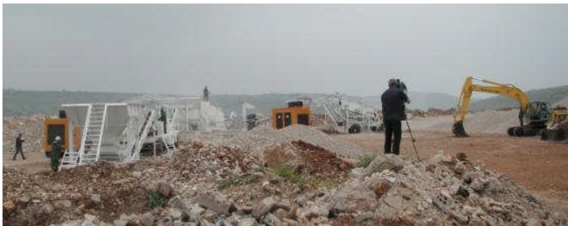
Photo 1: The rubble recovery setup in Southern Lebanon as part of the UNDP Pilot Project. The photo shows (from the left) the manual sorting belt, the crusher and the screening unit with generators and one of the excavators employed.

Such rehabilitation and reconstruction works, including the preparatory clean-up works, generated large quantities of debris which was often dumped in an uncontrolled manner along roads and on empty plots. In addition, a large number of damaged buildings and structures were to be demolished and removed, further exacerbating the problems with access for the rehabilitation works (with debris preventing access).