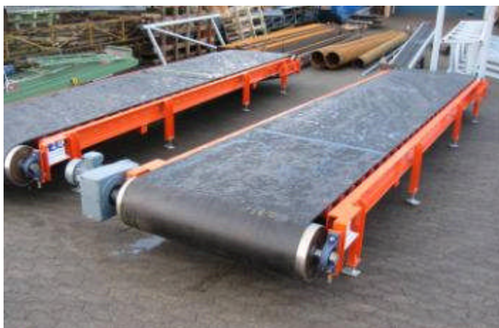
Photo 23: Typical conveyors with adjustable belt speed for use as a picking station.