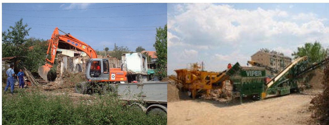
Photo2: Demolition of private homes in Kosovo with loading of the debris to be transported to the nearby recycling depot.

This dedicated project for demolition and recycling of the damaged buildings comprised the establishment of a Demolition/Recycling team, equipped with demolition excavators as well as a crusher and screening unit for processing the debris. In addition, the team was equipped and trained in the use of specialised asbestos equipment for dealing with those buildings which were contaminated with asbestos.