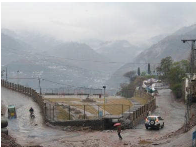
Photo 13: Rubble recovered as part of clean-up operations in Muzaffarabad (Pakistan) has been used as engineering fill material in this river gully, where a drainage system was put in place to allow the river to continue flowing uninterrupted.

Where the mixed debris does contain hazardous materials such as heavy metals, oils, and chemical residues, these hazardous materials will either need to be sorted from the debris for separate controlled disposal, or the whole debris quantity can be classified as hazardous and disposed of accordingly. The degree of contamination from hazardous materials would need to be assessed by sampling and analysis of the debris, with characterisation of the debris based on the results of the laboratory analyses.