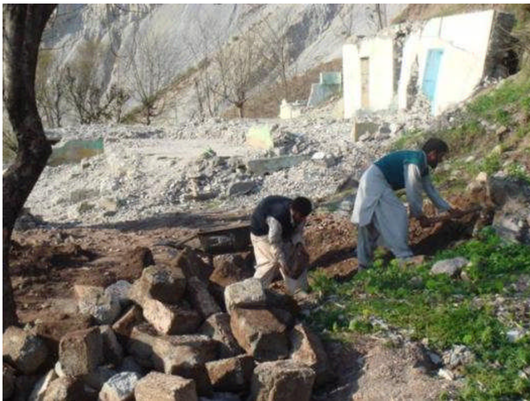
Photo 21: Islamic Relief project for the clearing and cleaning of debris (including rough cut stones) and subsequent reuse for new foundations

The debris can be strewn out on the ground, and manual labour used to pick out the non-recyclables and other items. The remaining material, i.e. inert materials such as concrete and bricks, can then be collected for processing.