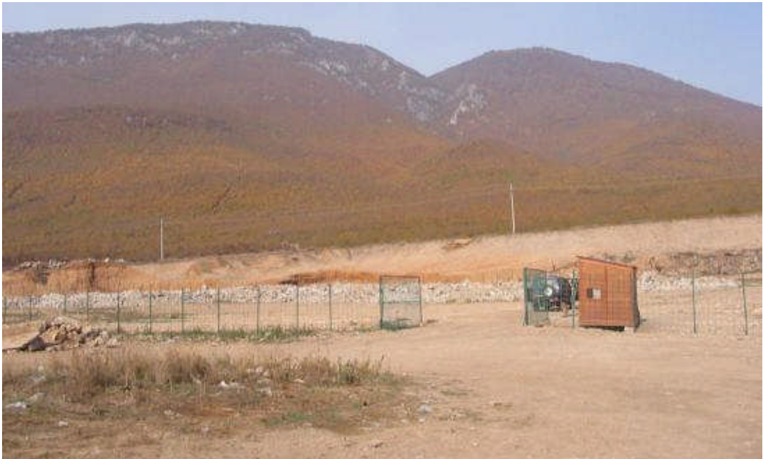
Photo 20: A temporary recycling depot in a rural area of Kosovo with hardstanding, fencing and gatehouse, as well as the gradual build up of debris for processing once quantities are sufficient.