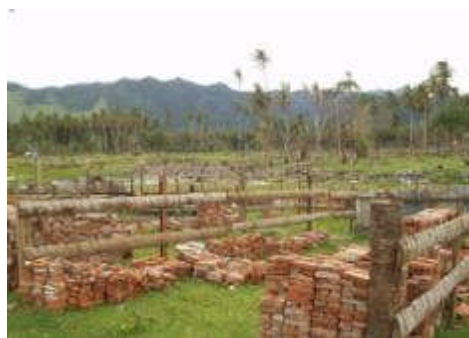
Photo 5: The received bricks are cleaned and stacked ready for reuse in the reconstruction works.

This innovative method of small scale recycling centre allowed finances to flow directly into the local communities (i.e. bypassing the contractors with trucks who would normally collect the debris) as well as provide reusable construction materials for the reconstruction process.