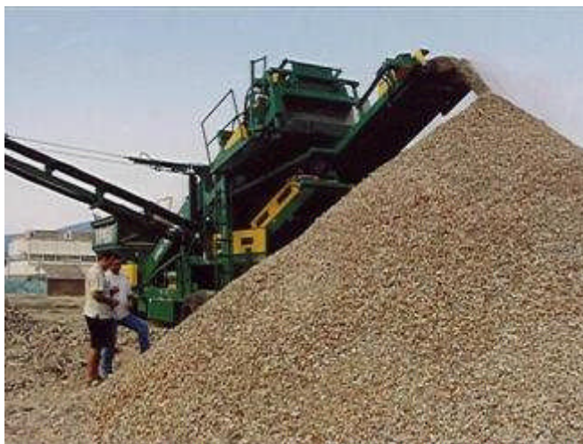
Photo 16: Recycled aggregate from crushing of building waste in Kosovo, as used for road construction or low strength concrete foundations.