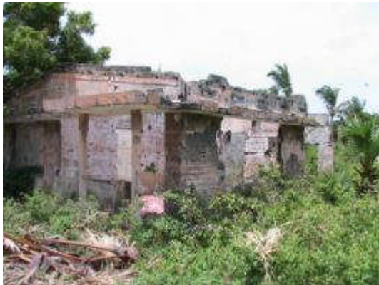
Photo 8: Post conflict (Jaffna, Sri Lanka) debris will often have reduced amounts of timber, furnishings and personal possessions since the buildings will often have been burnt during the conflict.

The composition of building waste from a disaster will also vary depending on the nature of the disaster 1 :