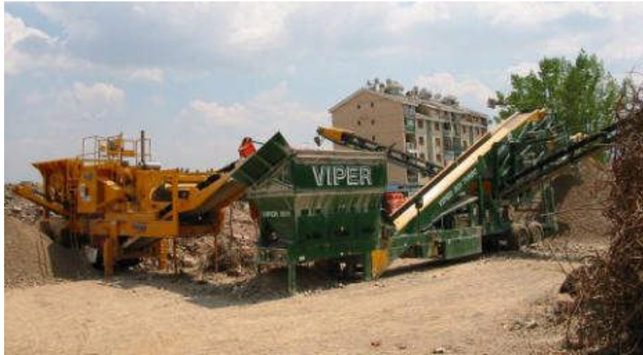
Photo 27: Crushing of debris in Kosovo using a medium sized mobile crusher (yellow machine to the left in photo) and a screening unit for separation of the crushed material into 3 size fractions (green plant to the right in the photo). (Source: Golder Associates).

Medium sized crushers for recycling debris will require an overband magnet for the separation of the reinforcement bars from the crushed material.