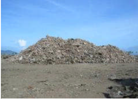
Photo 6: Concrete and bricks separated by the UNDP waste project in Banda Aceh from the mixed tsunami debris and ready for recycling into a road construction material.