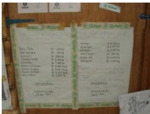
Photo 17: Payment list for a variety of building waste materials brought to the Oxfam GB reuse/recycling yard in Banda Aceh.

An example of this was the Oxfam GB reuse yard in Banda Aceh following the Tsunami where the yard paid a set rate per type of debris delivered to its yard, the debris being subsequently cleaned and reused / recycled in a variety of products.