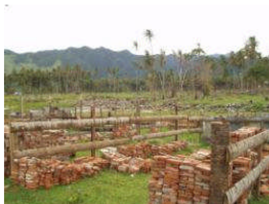
Photo 18: Stacked cleaned bricks ready for reuse at the Oxfam GB reuse/recycling yard in Banda Aceh.

The actual transport of the debris can be done by a range from wooden carts pulled by animals to heavy duty excavators, trucks and skips.