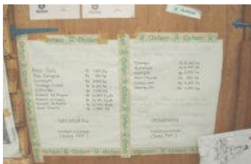
Photo 4: The price list at OxfamGB's recycling centre in Banda Aceh detailing the money which Oxfam will pay locals for each type of debris they can bring to the centre.

The Oxfam GB project included the establishment of a small scale recycling centre to which local people could be compensated financially for bringing debris to the centre, i.e. $x per wheelbarrow of bricks. This debris was then cleaned and reused in the rehabilitation works, i.e. bricks for new buildings, oil drums as waste bins for the roadsides, guttering for new housing etc.