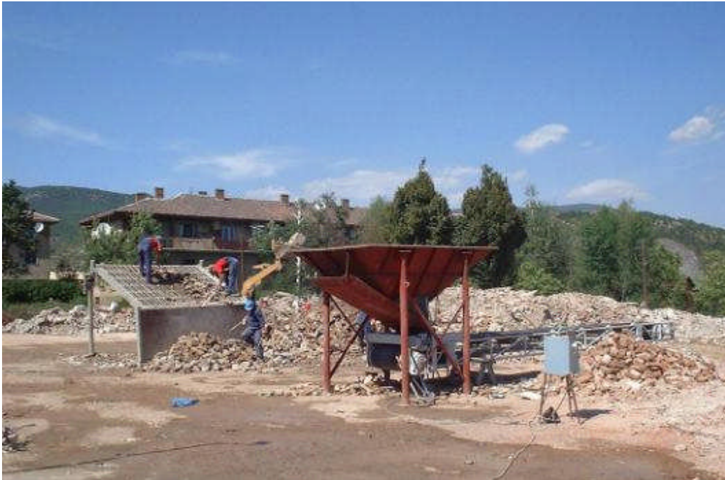
Photo 22: A mechanical “grizzly” to the left in the photo sorts the finer materials from the oversize concrete and bricks, whereafter the oversize can be placed on a picking station to the right in the photo for manual separation of non-recyclables.

Alternatively, basic plant can be constructed locally for the mechanical sorting of the debris, which provides a higher throughput with less personnel.