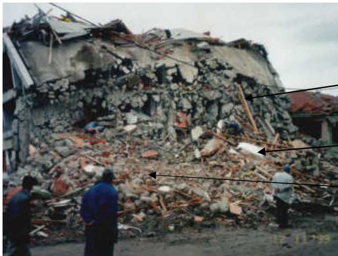
Photo 12: Mixed debris following the Marmara Earthquake in Turkey, 1999.