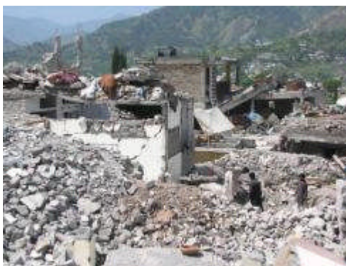
Photo 10: Post earthquake debris (Muzaffarabad, Pakistan) will most often have all the materials from the buildings still present at the footprint of the building.