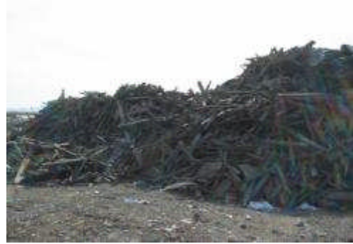
Photo 7: UNDP waste project separated timber in Banda Aceh and ready for use in the furniture making enterprise supported by the UNDP programme.