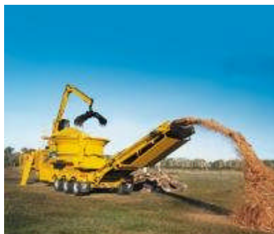
Photo 28: A typical mobile shredding plant for green wastes such as timber and wood.

For the timber and vegetative debris within the waste, grinders and shredders are used for reducing the volume of this waste stream. It can then, for example, be used as a mulch in landscaping or for composting.