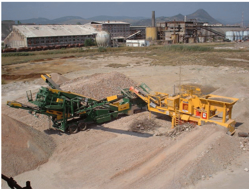
Photo 19: A typical recycling depot with crusher and screener at an industrial site on the outskirts of a city (Mitrovica, Kosovo), on hard standing and with recycled materials stockpiled ready for collection. (Source: Golder Associates).

Concrete blocks are normally required to be maximum 400mm by 400mm in size, with a maximum reinforcement bars protrusion of 100mm from the concrete blocks. This enables crushing of the concrete with minimised potential for plant blockages.