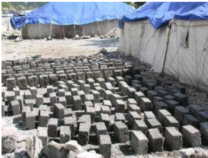
Photo 15: Building blocks for reconstruction purposes which can be produced from recycled building waste, Balakot, Pakistan.

Clean debris can be crushed and screened to a small fraction called fines and used in the manufacture of building blocks which in turn are used for the (re)construction of buildings. This process often only utilises a small part of the overall debris quantity crushed and screened since the fraction size required is relatively small as compared to the total quantity crushed, with the larger sizes of crushed material being used for applications such as gabions.