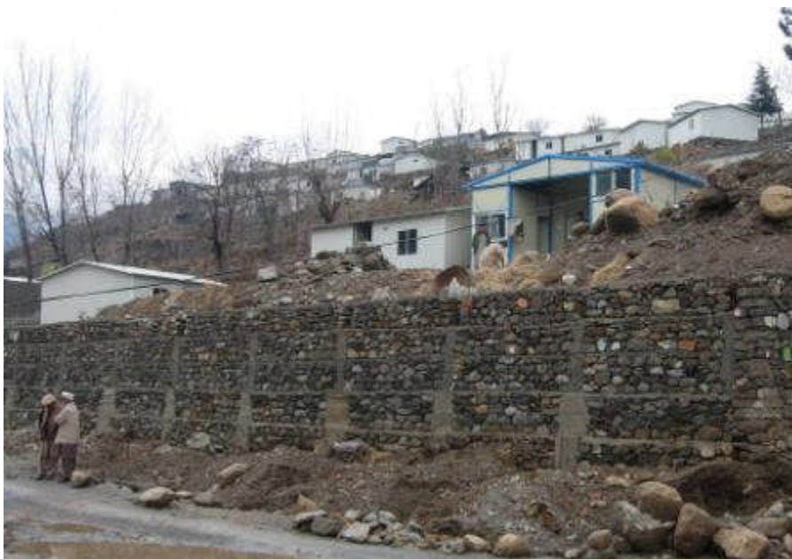
Photo 14: The use of reused debris for the construction of retaining walls in Balakot, Pakistan.